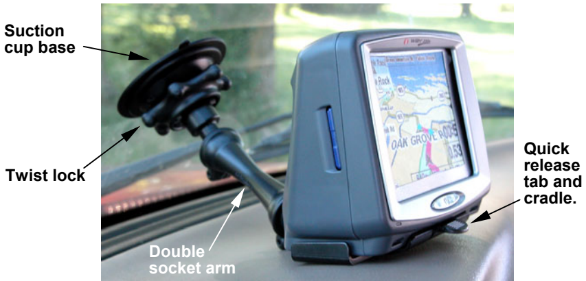
iWAY™ 350c mounted on dash with suction cup mount.

The mounting surface should be free of dirt and oil. Press the suction cup against the mounting surface and, while maintaining pressure, turn the twist lock until the arm is secure.